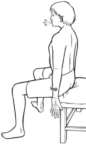
Fig. 1 Brügger relief position.

fall towards the wall when you are leaning forward → If your low back is arching too much the chair is probably too close to the wall → If your low back is rounding backwards too much the chair is probably too far from the wall